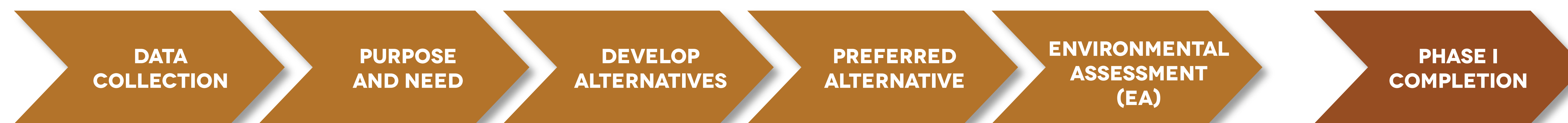
PUBLIC & AGENCY COORDINATION TIMELINE